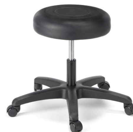
Fusion Round Stool R+

Wider arc of movement, still with flexible ease and comfort