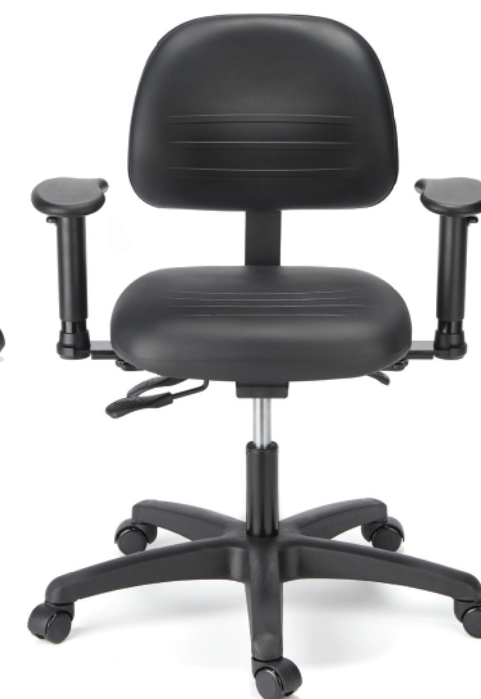
Fusion Fit R+

Anti-microbial, anti-bacterial covering conducive to infection control