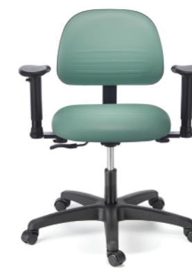
Fusion Fit R+