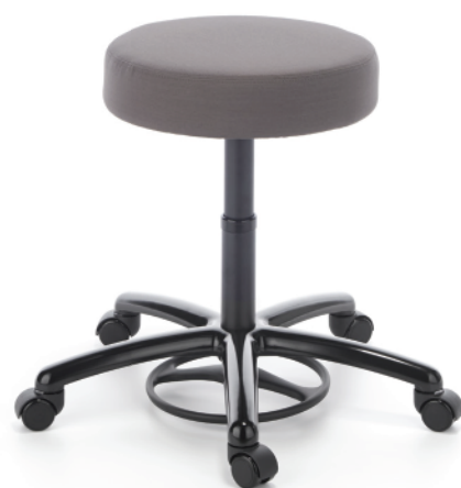
Fusion Round Stool

Slightly smaller footprint, same quality and proven performance