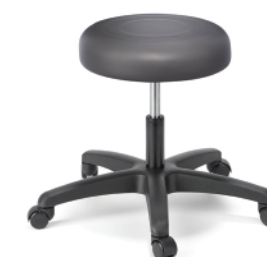
Fusion Round Stool R+