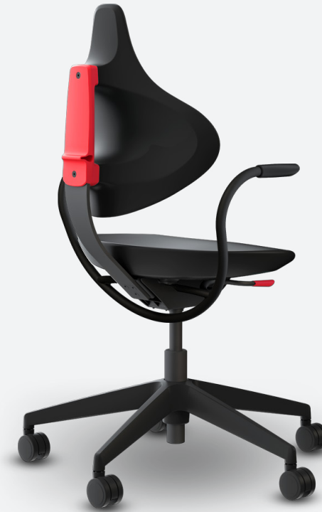
Desk height with arms.