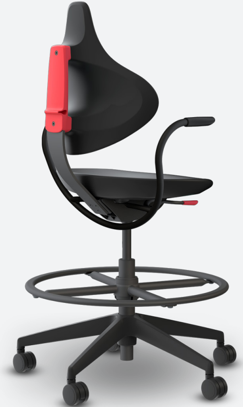
High height with arms.